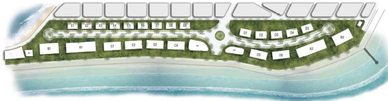
FEYDHOD TOURISM ZONE S4 PLOT ARRANGEMENT